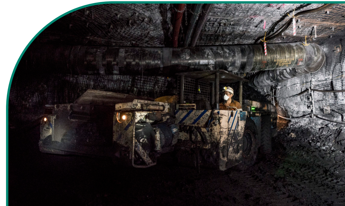
Image: Crinum Underground Mine - Lilyvale QLD.

Our team provided additional capabilities on top of the control systems integration. This included electrical detailed design, working in multi-discipline projects and onsite commissioning management. This experience has given us the ability to understand our client's overall project requirements to assist a successful project outcome.