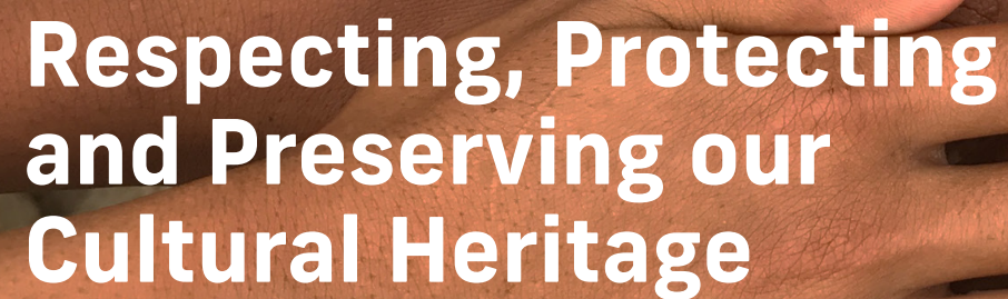
Image: Indigenous peoples' hands.