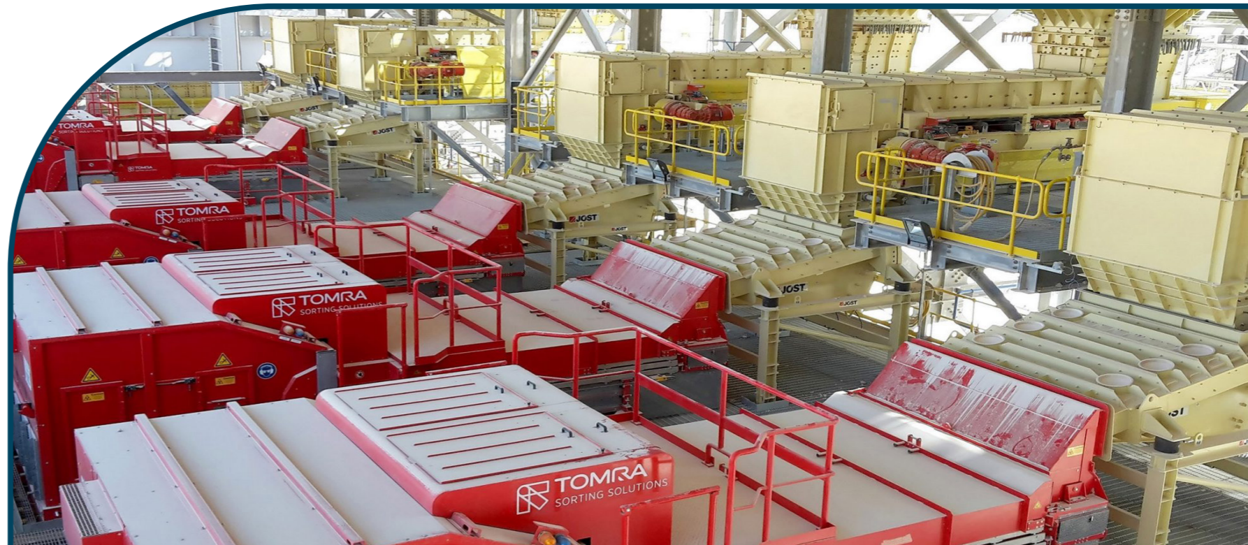
Image: Ore Sorting Installation.

Our team modelled the crushing sizes based on the proposed optical sorters' throughput and size capabilities. External factors such as the mobility of the plant, and environmental constraints such as noise and dust were all considered due to site's location.