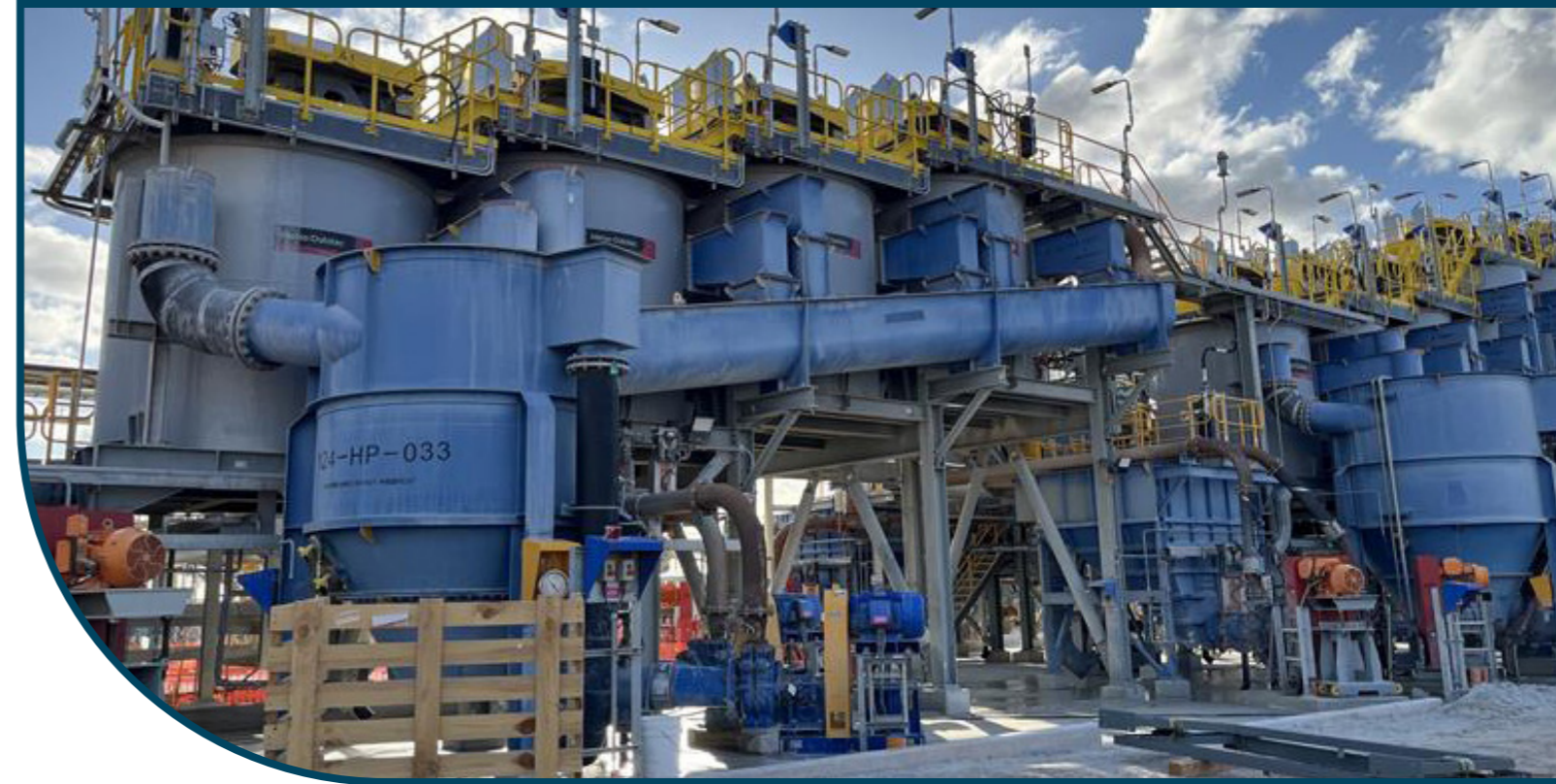
Image: Spodumene Flotation Circuit.

Additional plant included hydrogen reticulation, nitrogen generation, compressed air, multiple water circuits, water treatment and cooling water circuits along with additional reagents.