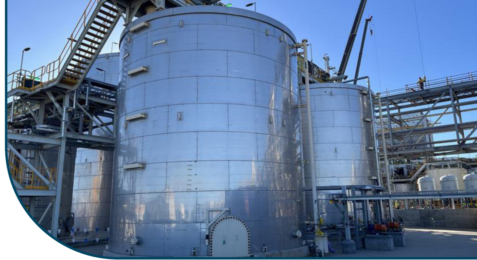
Image: Reagent Storage.

Stage Two will comprise of a selection and detailed design of the selected option for the system to function effectively. This evaluation accounts for modifications in the process criteria for the calcium carbonate and sodium hydroxide circuits, along with any downstream impacts in the neutralisation and filtration unit operations.